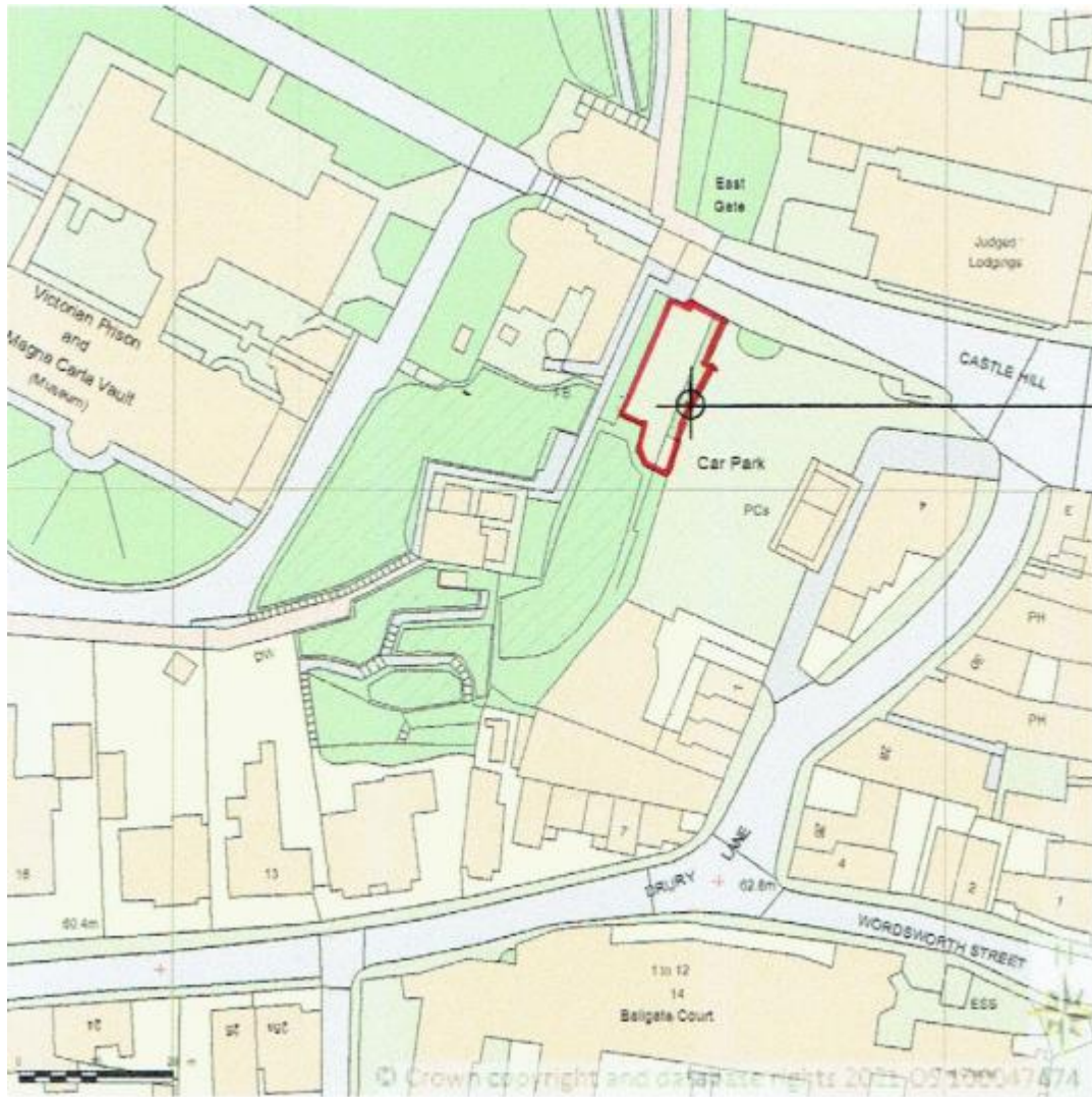
Site location plan